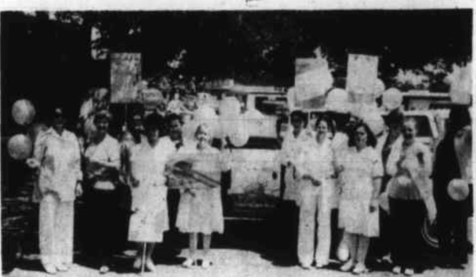
Good Health Week being observed this week, April 20-26. An open house and tours of the hospital will conclude the week's activities from 2 to 4 p.m. this Friday.