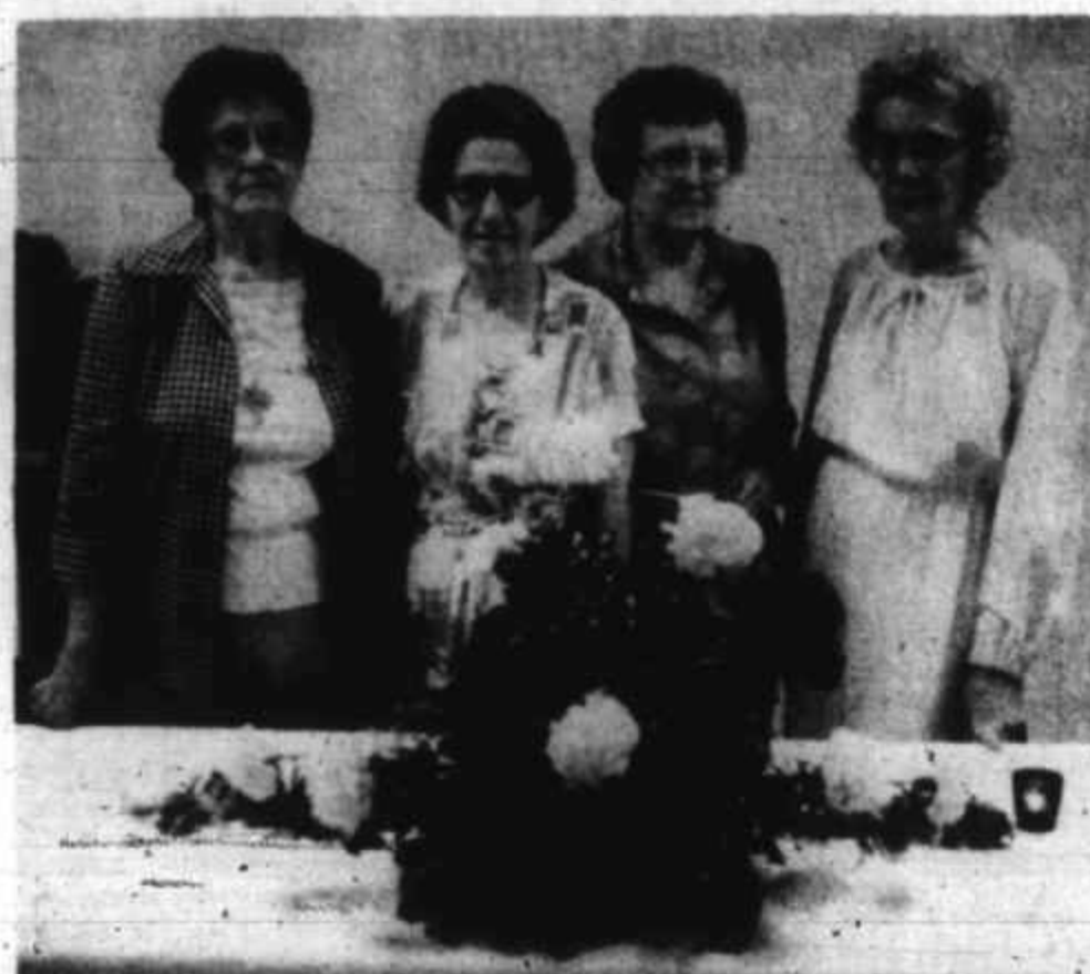
Four charter members of the Eagle Lake Fire Dept. Ladies Auxillary attended the 20th Anniversary banquet in the Fireman's Hall last Saturday evening. They are shown